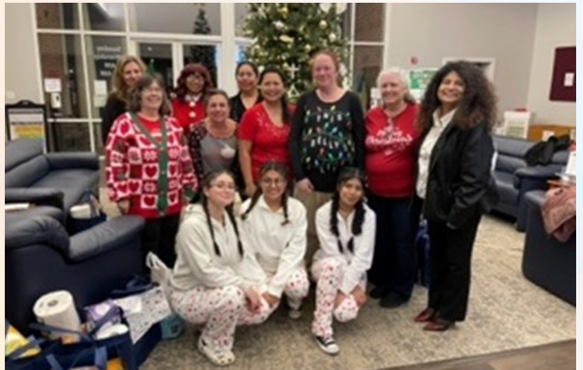
SCC staff at their annual Christmas Party