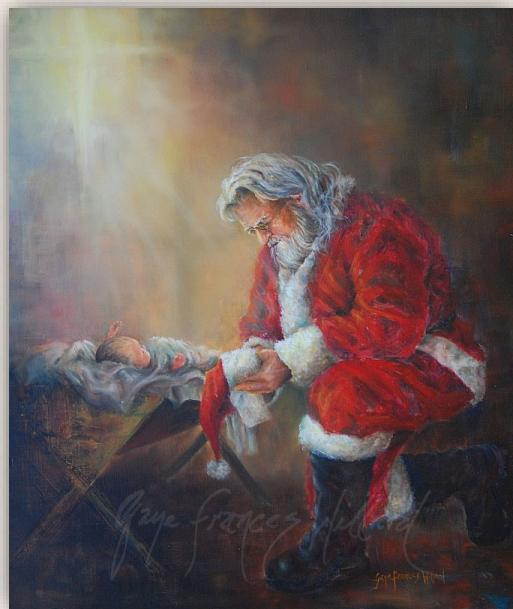
"Every Knee Shall Bow"

invite friends and neighbors to this year's Living Nativity event. As always, it is our gift to the community!