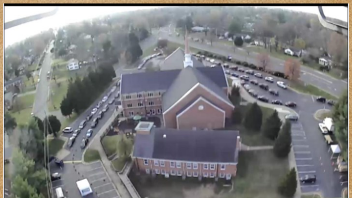
This is an aerial view of the line on Nov. 21 at 8:30 am. We had sections with 2 lines, even split into 3 lines in front of the main entrance, and the line continued to Plantation Lane.

She now has a new job that she loves, making $3.00 more an hour than she was before. Her job is near her sister's house, and her sister will babysit for her, while she's at work. All these wonderful blessings because our church family ALL pitched in to help someone in the community. I thank GOD every day for our church family and for being able to reach, nourish, and serve in such an impactful way.