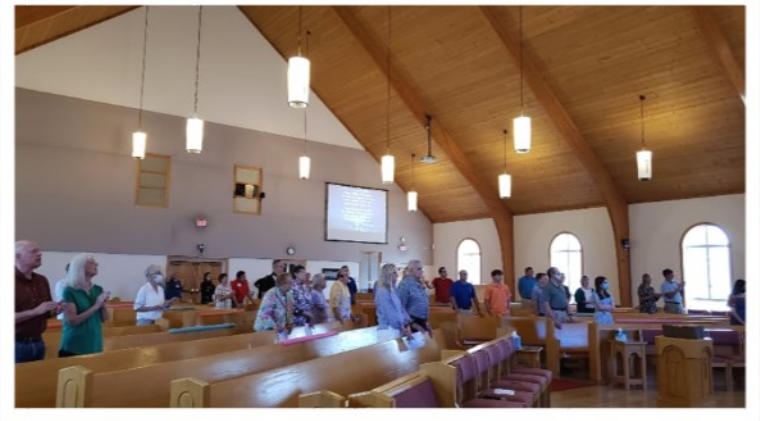
About 50 people gather for our 3 rd week of worship on June 20, 2021 – including several first time guests! Praise be to God for old & new friends.

That's why we're SO excited to be gathering regularly again at BOTH services, which fully resumed on Sunday, June 27. Our regular worship times are 9 AM and 11 AM on Sundays and we'd love for you to join us in person or virtually through our livestream.