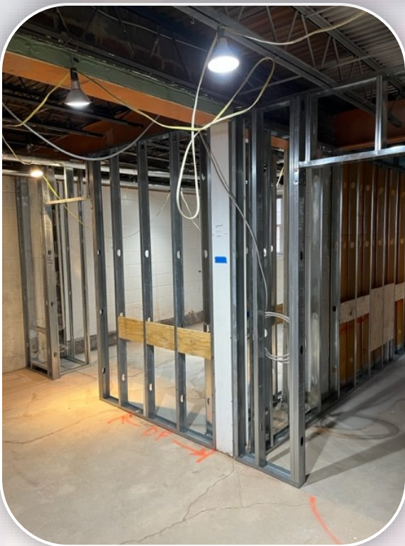
Below Left: Bathroom framing prior to installation of pipes and wires. Below Right: Break room upper cabinets installed with the new boiler visible on the right.